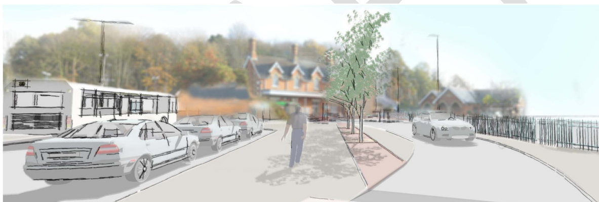
Artists impression of new interchange at West Malling Station

We have been impressed by the willingness of the rail industry to engage with us to promote a current scheme at West Malling Station. The project involves a major remodelling of the forecourt and approach road and we believe this provides a model way of working. Disappointingly, financial contributions from the rail industry and the DfT have been absent. Nevertheless, we are looking to fund works through creative use of Section 106 monies from developments in this area.